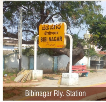
Bibinagar Rly. Station