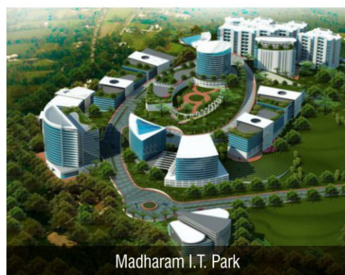
Madharam I.T. Park