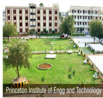
Princeton Institute of Engg and Technology