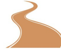
40 Feet & 30 Feet Roads